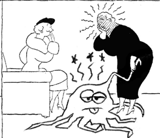
Bertha: "Oh, dear! I'm so embarrassed!"