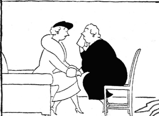
Ethel: "Your Old One is just out of sorts! You need to see the Lovecraftians at Arcana! They'll know what to do!"